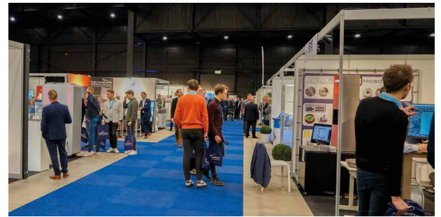
Impression of the Precision Fair 2021, which was the first edition in the Brabanthallen in Den Bosch.

Partially overlapping with the Precision Fair, the European Society for Precision Engineering and Nanotechnology (euspen) will organise its second international Special Interest Group on Precision Motion Systems & Control congress on Tuesday 15 and Wednesday 16 November.