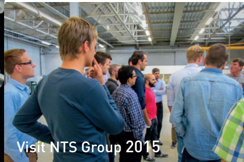
Visit NTS Group 2015

Make use of this unique opportunity, and become a DSPE member for half a year, completely FREE of charge. See other side for more information and registration.